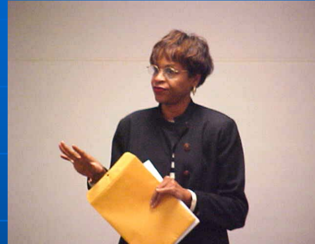
Senior Rights and Program Advocate