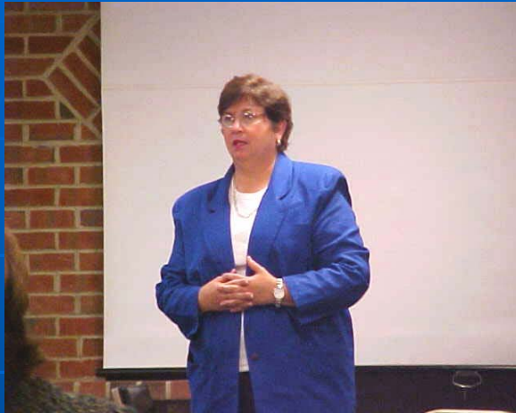
Civic Association President

DURING and FOLLOWING Neighborhood College, some participants WERE very ENGAGED.