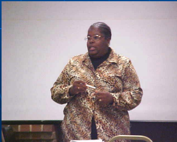
Civic Association Officer