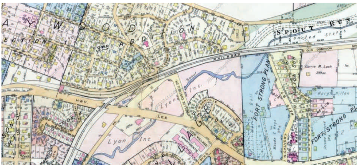
1943 view of North Highlands Requested Area. I-66 Came much later. Published by Franklin Survey.

Please send checks and reservations to: Arlington County Civic Federation, 100th Anniversary Gala, P.O. Box 42091, Arlington, VA 22204