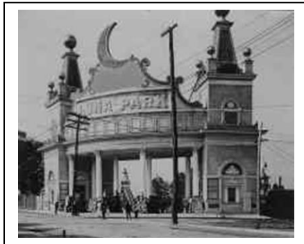
Entrance to Luna Park-Now Crystal City