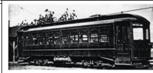
Penrose Streetcar--Rosslyn to Nauck