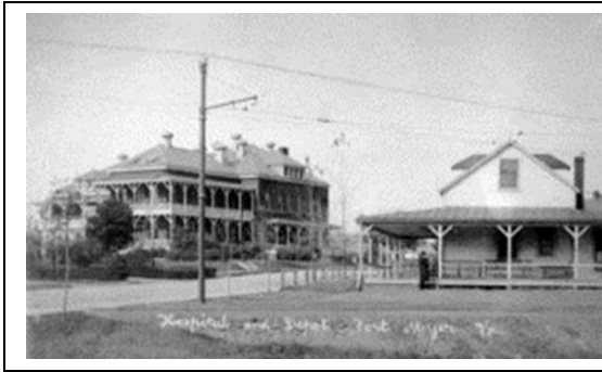
Ft. Myer Streetcar Terminal