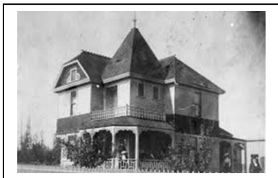
Seeley McIntyre House