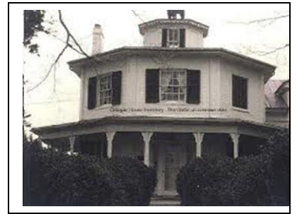
Historic Glebe House