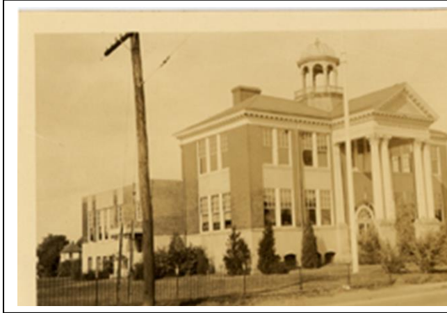
Historic Wilson School in 1916