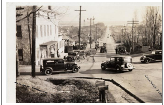
Columbia Pike Traffic Jam