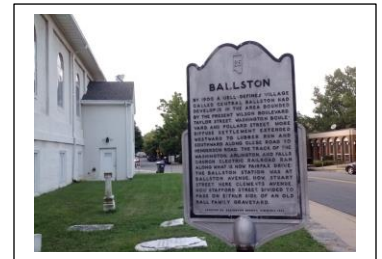
Ballston founded ca 1900