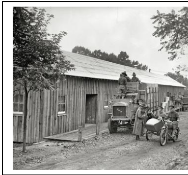
Ft. Myer 1917

The Arlington County Civic Federation was founded in 1916. Arlington then consisted of 7500 households & 16,000 people. The earliest members-- neighborhoods of Clarendon, Hume. Cherrydale, Bon Air, Lyon Park, Lyon Village plus the Jefferson District Woman's Club--voted in favor of a sewerage tax to create the first county wide sewerage system in the U.S. The Federation now 100 years young is why Arlington smells so good today!