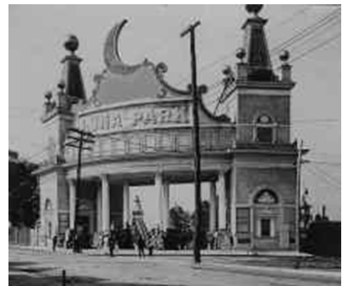
Luna Park near Crystal City