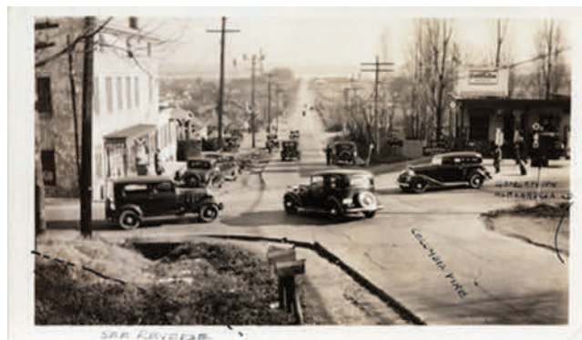
Traffic Jam on Columbia Pike