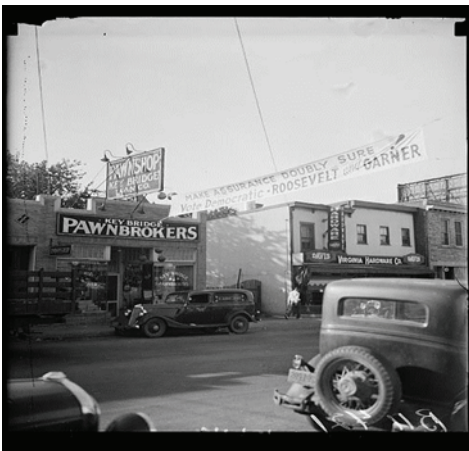
Pawn Shops in Rosslyn

We'll look forward to seeing you on April 8 and April 14!