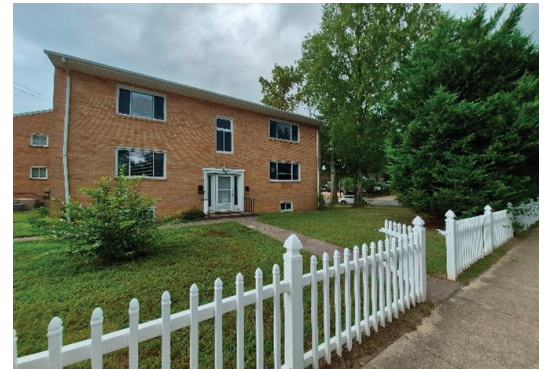
INTERNAL CONVERSION TRIPLEX; ALCOVA HEIGHTS