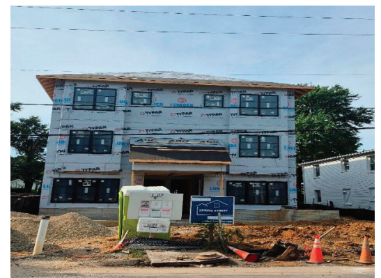
SIX-PLEX; BALLSTON-VIRGINIA SQUARE