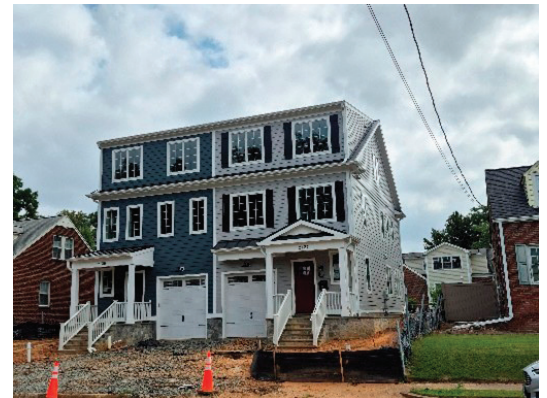
SIDE-BY-SIDE DUPLEX; NORTH HIGHLANDS