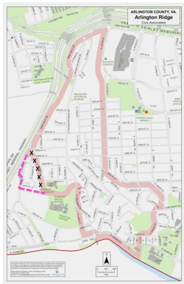
Figure 2 ARCA Boundary Modification (Proposed)

The Federation will also consider a resolution from the Environment Affairs Committee supporting the County's efforts to improve and