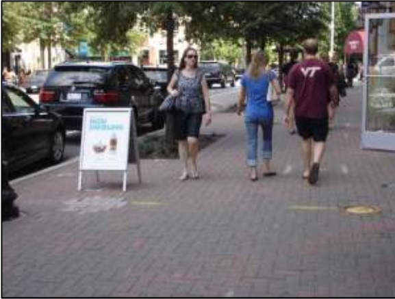
Temporary sidewalk sign