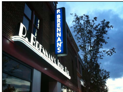
Lighted wall sign (historic façade)